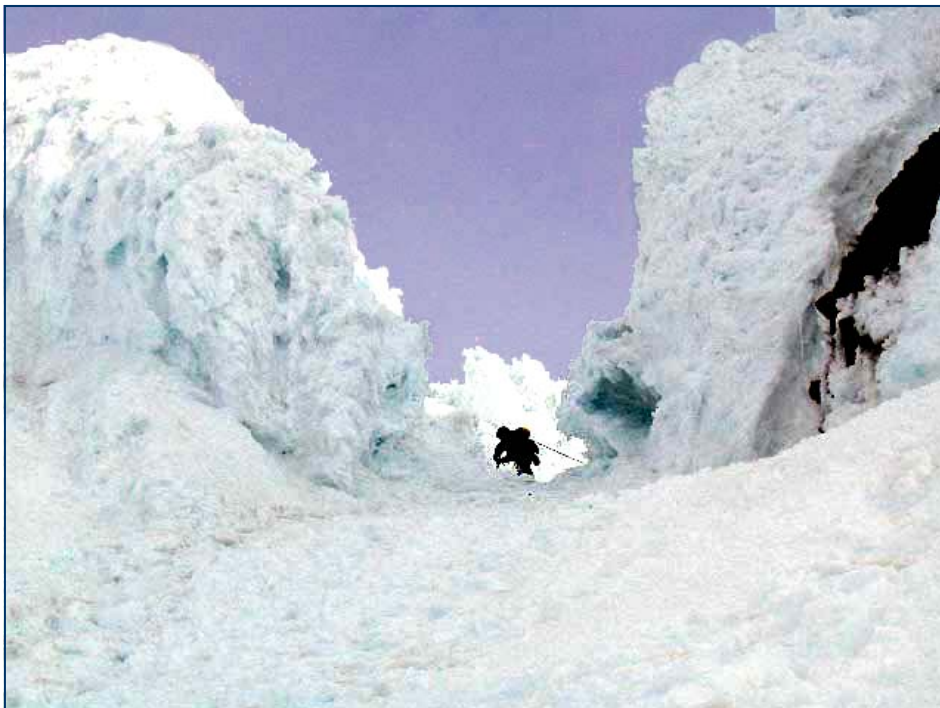
Coming through the Pearly Gates—Mt Hood.

As is often the case, the group fell apart a bit on the descent. First one, then another, tried their hands (or seats, rather) at glissading (crampons off first!). When we "assembled" back at the top of the ski area, three were already gone, not to be seen again until we got back to the