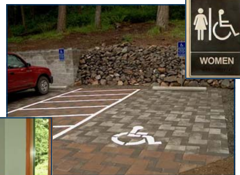
Disabled parking and rest rooms to ADA requirements.