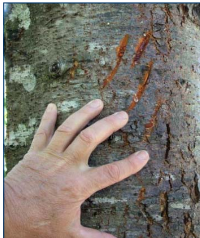
Claw marks in tree

HAVE YOU NOTICED some brown, dead trees along Highway 58 between Lowell and Willamette Pass and wondered if the bark beetles have spread to the west side of the Cascades? They haven't. That's bear damage! Black bears in western Oregon have an unusual appetite for the cambium of fir trees, just as the trees are starting to "bud." The cambium and surrounding tissues provide the nourishment to the trees; when the bark is ripped off, the trees die. Who "wood" have thunk it! Dave Walp showed us many recent examples of damaged trees, including some very prominent claw marks. Enjoying the excursion were nonmember Lou Marenz and Obsidians Nola Nelson, Richard Hughes and Lana Lindstrom.