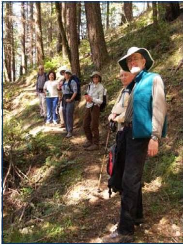
The Fall Creek crew.