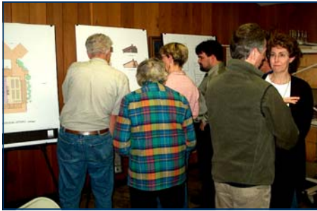
Jan. 05 - Planning and design .