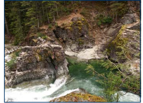
The inviting Little North Santiam

river, especially during spring run-off season.