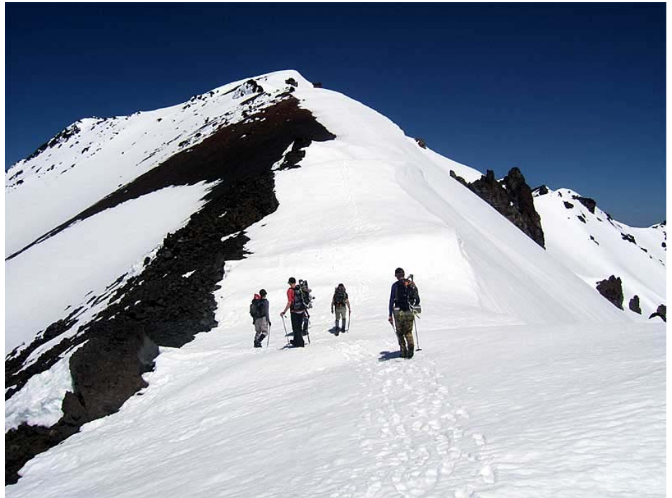
On the summit ridge—Diamond Peak

The descent was marked with lots of post-holing in the softening snow and some nice glissades. Several of us tried