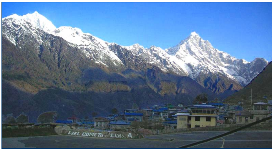
Welcome to Lukla

To get to the Everest region in the Himalayas, you have basically two choices: drive to the end of the road to a town called Jiri and begin walking; or fly into a little village called Lukla, which is about a five-day walk past Jiri. Lukla is at about 9,200 ft. elevation in a valley surrounded by peaks that are 20,000 ft. or higher. You get there in a plane that has a maximum flying elevation of about 14,000 ft., and you go across a 13,000 ft. mountain pass to get into the valley. Once you are in the valley, you head up the valley and land on a runway that slopes uphill into the side of the mountain. This is a "one shot" landing -- the runway looks impossibly short from the air and there is a big wall at the end of the runway; if you have trouble coming