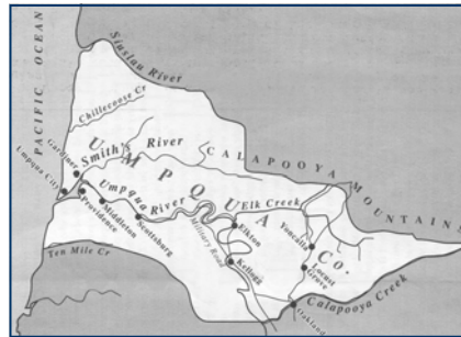
Lost County of Umpqua

We then drove along Tyee Road to Elkton with Ewart Baldwin explaining the geology. We stopped at Scottsburg County Park for lunch during a window of dry mild weather. Our next stop was at the Umpqua Discovery Center, the highlight being their new exhibit, "Pathways to Discovery -- Exploring Tidewater Country." We completed our Umpqua tour at the lighthouse viewpoint overlooking the mouth of the river. There is lots of history: about the natives, the