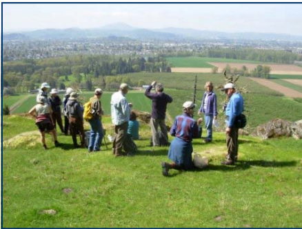
Viewing Eugene-Springfield from Baldy

T HE ANNUAL Mt Baldy/Coburg Hills hike was again a success -- excellent hiking weather, excellent hikers, no problems at all. We went from SEHS out to McKenzie View Road and the gate leading to the Buck Pasture where we parked our cars. After intros, I explained the special permission we have to visit the area; and also, since it's a six-mile circle trip, we can't leave anyone along the trail to pickup on our return. In other words, go the distance. Back down to the road and east to the trail gate; then up toward the east caves via the Kirk Memorial Trail. We visited the cave and viewed the many rock climbing routes on the vertical rock faces above the trail. When we got above the caves we walked over to the overlook, which gives an excellent view of Springfield/Eugene, including views of the ever expanding homes, shopping centers, hospitals, etc. From there, we headed toward Baldy using the cow/deer/raccoon/turkey/people trail, which is basic cross-country walking through pastures and forest.