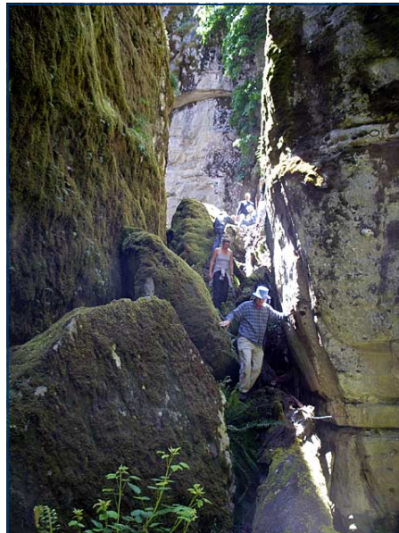
Entering the den

We parked at the usual spot and started hiking up the new, improved road. I miss the good old mud and ruts. Apparently so do the motorized two and four wheelers -- they're tearing up the trail sections now. Gargh!