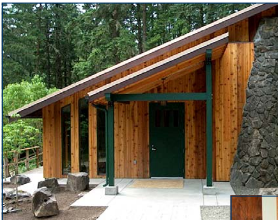
An attractive, functional new entry.