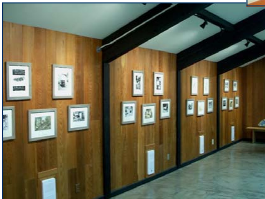
Greatly improved heating and lighting in the main hall.