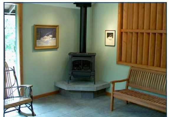
A comfortable reception in the new entry area.