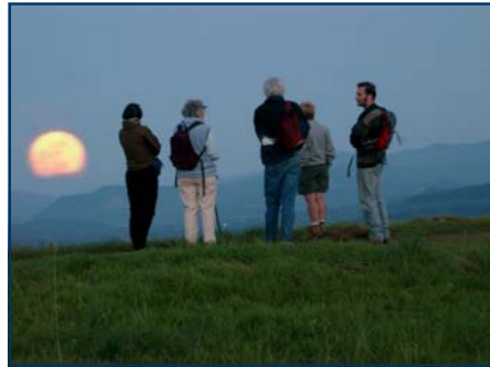
Sunrise over Pisgah