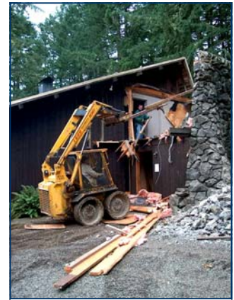
Dec. 04 - Demolition of old Lodge entry.