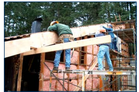
Feb. 06 - The big beam goes in.