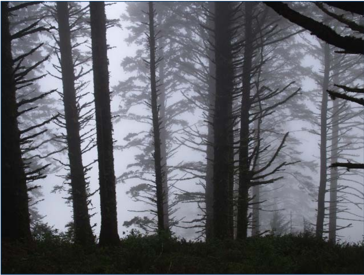
Nature's own black and white. At Heceta Head. See trip report Page 11.