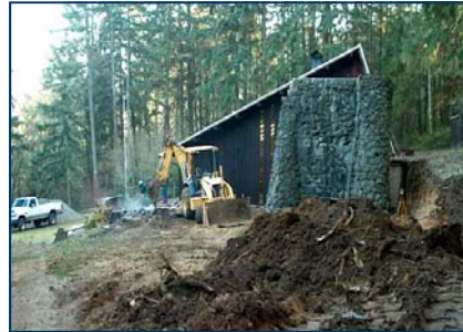
Dec 05 - Digging begins - Finally!