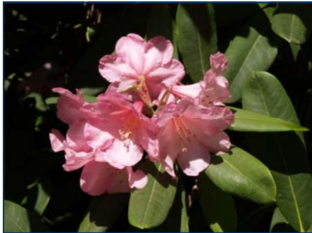
Rhody in prime

LEADING AN EXPLORATORY" trip means getting lost is a possibility. But in the middle of Eugene!?! Everyone knows about Hendricks Park's Rhododendron Garden, but few explore the other 60 acres of the park, all undeveloped forest (except for a few walking trails). That was our mission. Starting from the picnic area and guided by map downloaded from the park's website, we embarked on what I later learned was the West Trail. It should be pointed out that the new kiosk trail map, the web map and a brochure (available on the backside of the kiosk) all display slightly different trail alignments. It's easy, however, to come upon many side trails and forks in trails not shown on the maps.