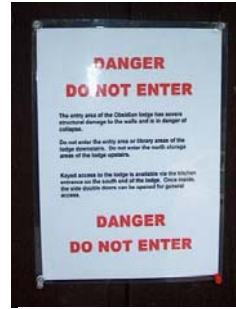
Sep. 04 - Oh-oh! Trouble in River City