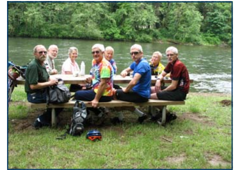
Lunch overlooking the McKenzie