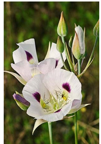
Big-pod Mariposa Lily Calochortus eurycarpus