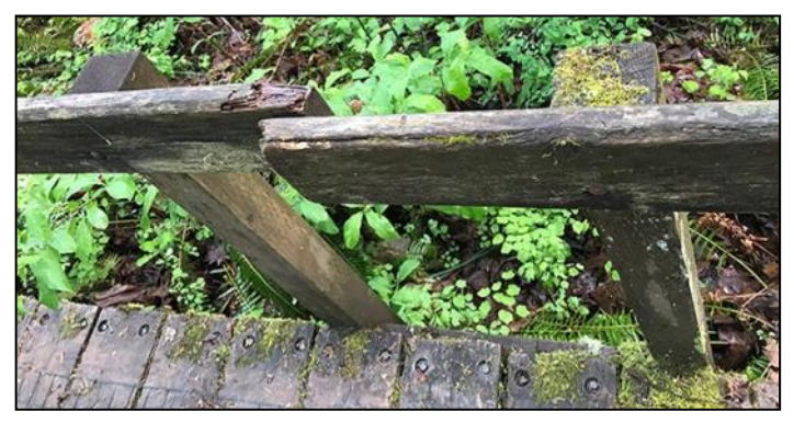
A portion of the rail showing a rotten section.