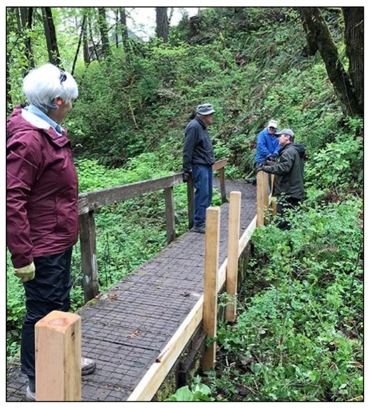
All the posts are in place on this section.