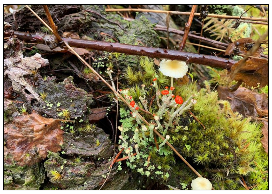
Red pixie-cup lichen. See Salmon Creek Mother's Day Hike trip report on page 8.

ENJOY the photos in color! ONLINE Bulletin at www.obsidians.org