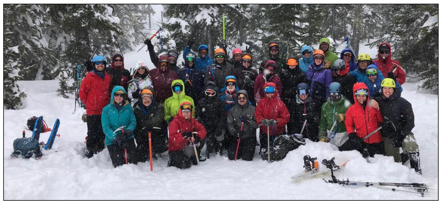
Snow Skills Day: the class and volunteers at Hayrick Butte.