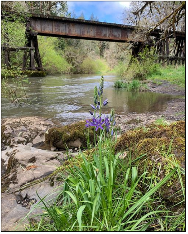
Camas and railroad bridge over Marys River.

EIGHT OBSIDIANS AND SIX GUESTS MADE THEIR WAY TO FIT-TON GREEN NATURAL AREA outside of Corvallis. This area is adjoined by the Crestmont and Bald Hill Farm land trusts,