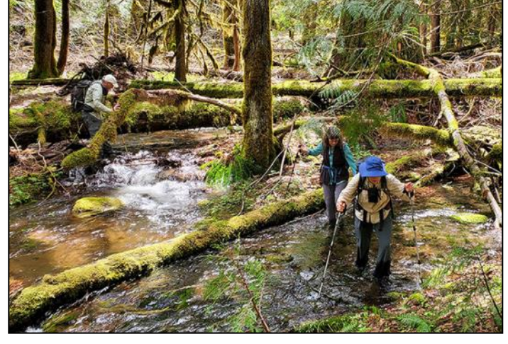
As we continued, we finally realized it was futile to keep our feet dry. Lorraine Cuevas, Lynn Meacham and Dave Cooper ford the stream.

OUR GROUP DROVE THROUGH SOME RAIN ON THE WAY TO THE OFFICE COVERED BRIDGE, but it was not raining at the trailhead, 30 miles up the Aufderheide Drive. Because of the rainy spring that we have enjoyed, the challenge of the hike was crossing the creeks that flow across the forest floor around some of the tallest trees in the Cascades. A few preferred log-walking, while most in the group were content to wade through the water with trekking poles for balance. A remarkable grove of red cedars is found where the North Fork