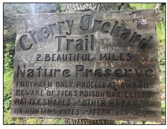
Charming old sign.

T HREE OF US MADE THIS HIKE ON THE WASHINGTON SIDE OF THE COLUMBIA RIVER GORGE. We were on the trail at 10:20 AM. After about a quarter of a mile, we broke out into