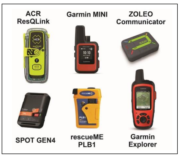
An assortment of personal beacons.

Some highly rated Satellite Messengers are the Garmin inReach series, the SPOT and a newcomer, the ZOLEO Communicator.