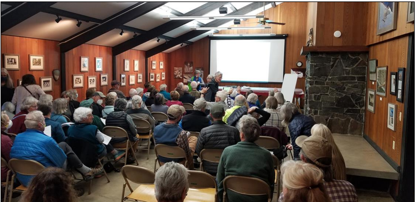
Seventy people attended the Camp Reiter rally at the Lodge on March 25.

ENJOY the photos in color! ONLINE Bulletin at www.observians.org