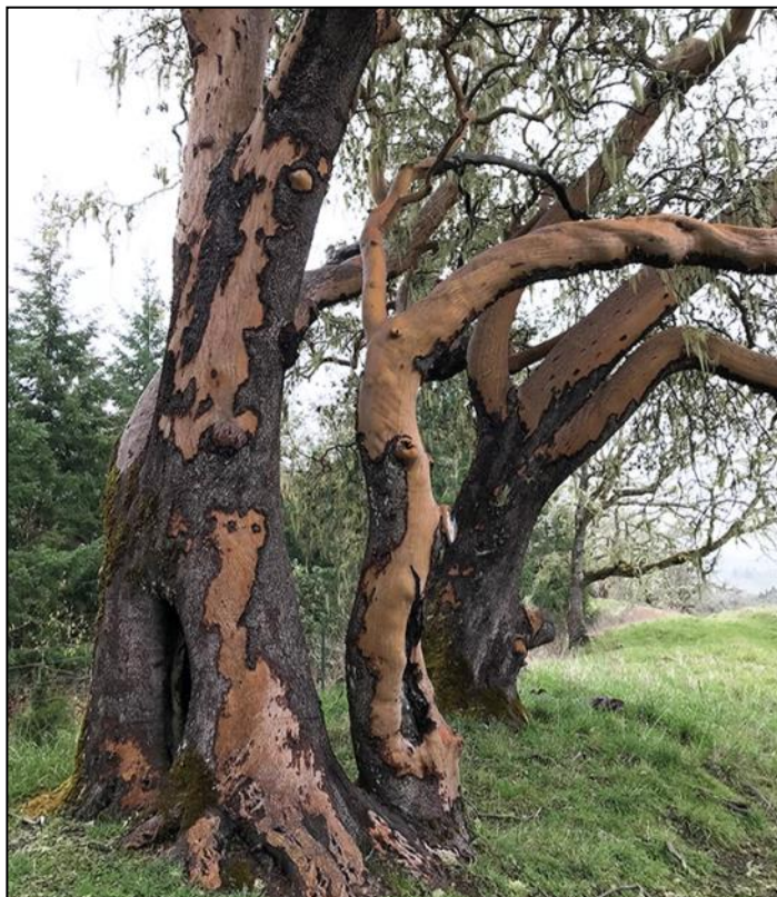
Beautiful madrone trees.

open oak savannas. It was the first time for Lorraine to hike the trail and she was most impressed by the ancient madrone trees, especially on the Thistle Ridge side trail. On the downhill section of the loop, we were amazed to see so many showers of shooting stars, fawn lilies, baby blue eyes, and houndstongue spreading out over the hillside. We met only two other hikers on our quiet four-hour hike. It was perfect hiking weather—not too hot. Members : Lorraine Cuevas, Janet Jacobsen.