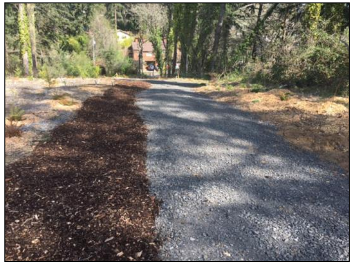
The Ribbon Trail is now the right width to blend in with the lower part of the trail to Central Blvd. near the Obsidian Lodge.