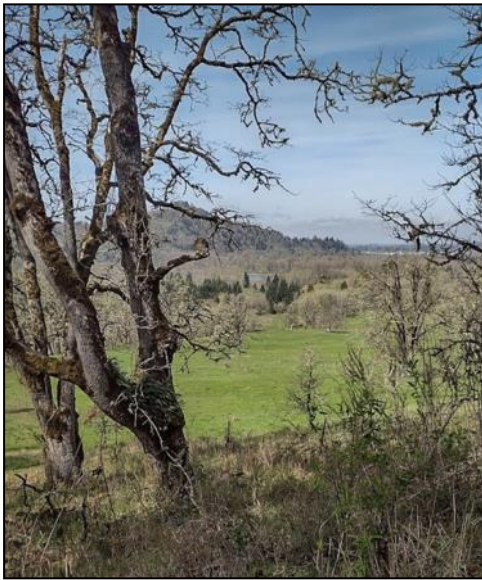
Pisgah hike

Our smallish group gathered in the north parking lot, most of us circling sixtyish. One woman was dealing with long COVID, which would dog her a bit on the hike. However, I watched the group spread out a bit, as is natural. Two guys went ahead at a faster pace, some folks held middle ground, and as the woman with long COVID straggled a bit, people stayed back with her to make sure she was okay.