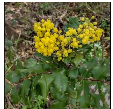
Oregon grape in bloom.

Camaraderie, lovely scenery, good conversation, fresh air and exercise—a hard combination to beat in one of America's loveliest states.