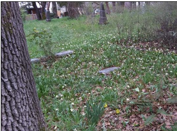
Field of fawn lilies at the Masonic Cemetery.