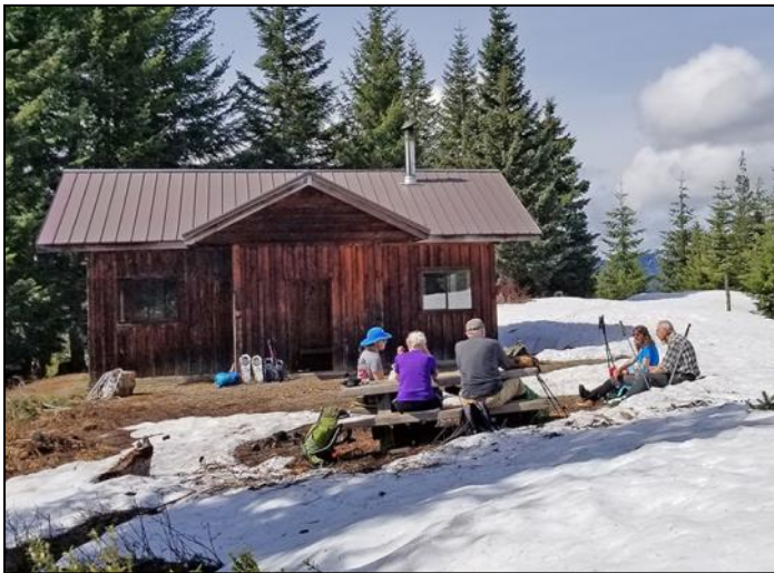
Lunch near Mountain View Shelter.