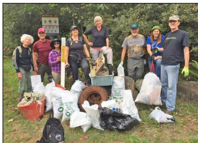
9/29/2018: Obsidians with their haul at Baker Beach trailhead—211 lbs. of mixed debris!