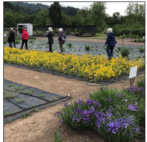
A bed of brilliant Oregon sunshine.