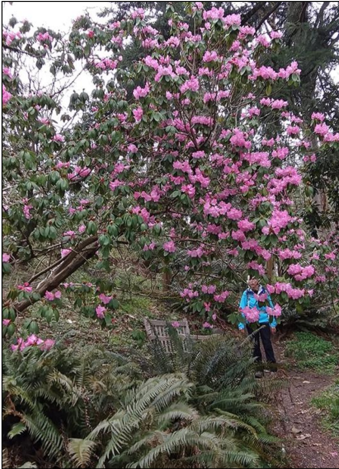
Rhododendron in bloom at Hendricks Park.