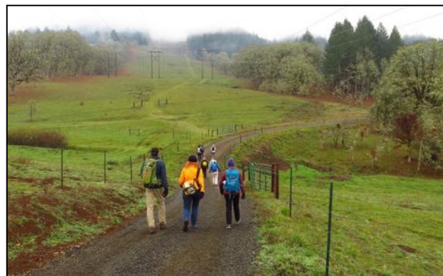
Obsidians hike Fitton Green in 2019.

From the Panorama parking area walk straight out in front of you, which is southwest. Pass the first Throop Loop trail (left) and go on to the second Throop Loop trail (up to the left), which takes you to panoramic views from on high. While heading to the second Throop Loop entry, notice an Escape Route to the right. When you come down from on high, take the Escape Route down the hill. This is really the