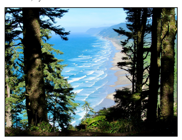
A favorite view for Obsidians.