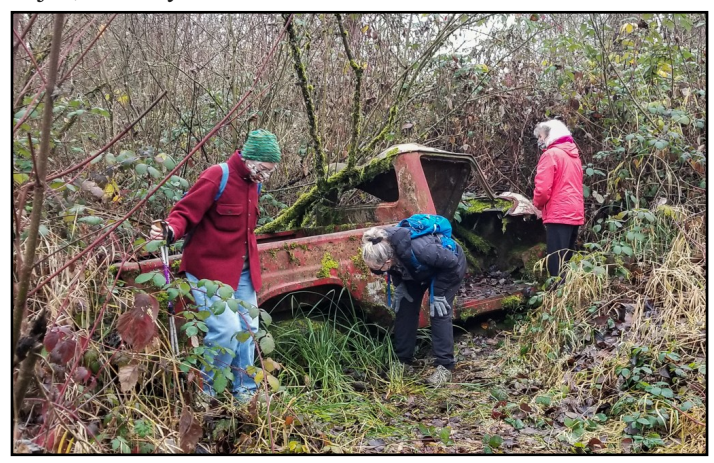
Dorothy, Kathie, and Angie explore the old truck.

SHORT HIKE WITH PLENTY OF EXCITEMENT AND SURPRISES. From the northernmost street of the Eugene city limits, we meandered bushy, overgrown, slippery and somewhat muddy trails north almost to the Wilson Bend. In the blackberry jungle between the ponds and rushing Willamette River, we discovered an old rusty truck and a mysterious wooden structure. Along the river, we saw big frogs, chirping small birds, and one bald eagle. On the way back, we enjoyed river otters, huge jumping fish, close-by beaver in the pond along the trail, and a gang of wild turkeys roosting high in the branches of big leaf maple trees. Everyone enjoyed our crepuscular hike. Members: Kathie Carpenter, Angie Ruzicka, Darko Sojak, Dorothy van Winkle.