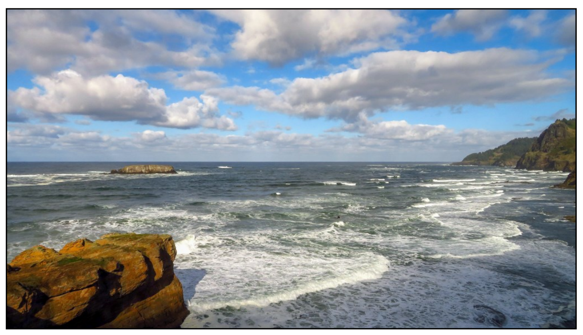
Looking north with Otter Rock on the left. (See report for Moolack Creek on page 7.)