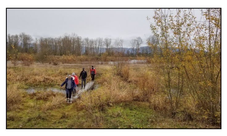
Crossing the bridge to the little pond.

DESPITE STORMY WEATHER PREDICTIONS, 13 of us ambled our way for several hours about this lush riparian property with little to no rain—and next to no signage to guide or educate us! McKenzie River Trust's Green Island is open to the public only a few days a year. We appreciated the one staff/ volunteer at the gate who suggested that we take a photo of the map board and stay on the graveled paths. There would be no further guidance for the day. Thinking we couldn't get too lost and slightly reassured that volunteers would be out looking for stragglers (a.k.a. lost hikers) at the 3:00 closing, we split into two groups and crossed paths only once late in the day. Phones recorded our efforts at 5.8 to 8 miles. Why an island you ask? Go yourself to see if you can learn the answer to that question. Wildlife reported: one large bounding deer, a pair of red-tail hawks, a few LBJ birds (little brown jobs), a ton of scat—likely from well-fed coyotes and maybe some berry-loving bears—and one beautiful turkey feather. (Editor's note: For information about future events at Green Island, check the website at mckenzieriver.org/property/green -island/). Members: Mari Baldwin, Patricia Cleall, Kathie Carpenter, Lynda Christiansen, Elizabeth Grant, Nancy Hoecker, Lou Maenz, Wally Miller, Michael Myers, Angie Ruzicka, Darko Sojak, Karen Yoerger. Nonmembers: Jerry Pergamit.