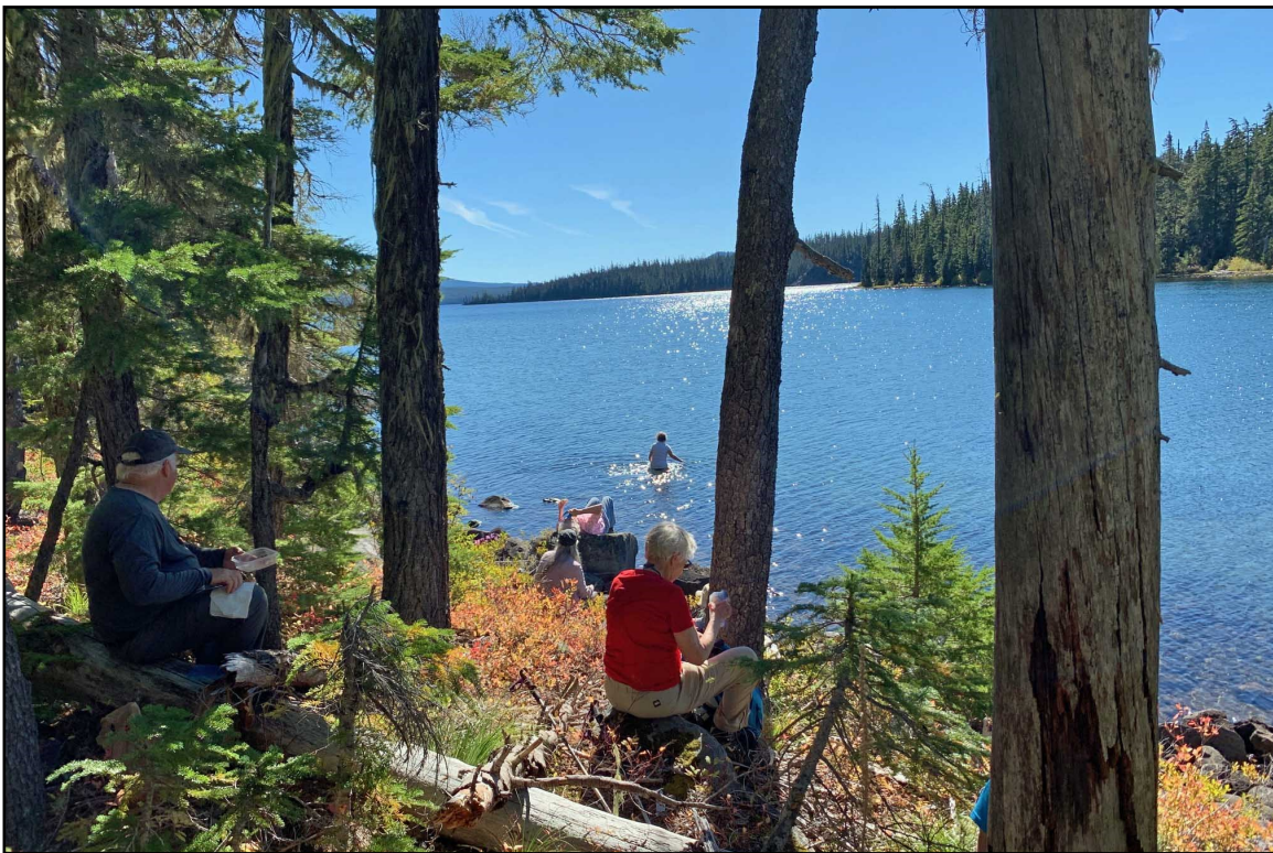
Photo taken on Rigdon Lakes hike by Esme Greer (See trip report on page 10.)

ENJOY the photos in color! ONLINE Bulletin at www.observians.org