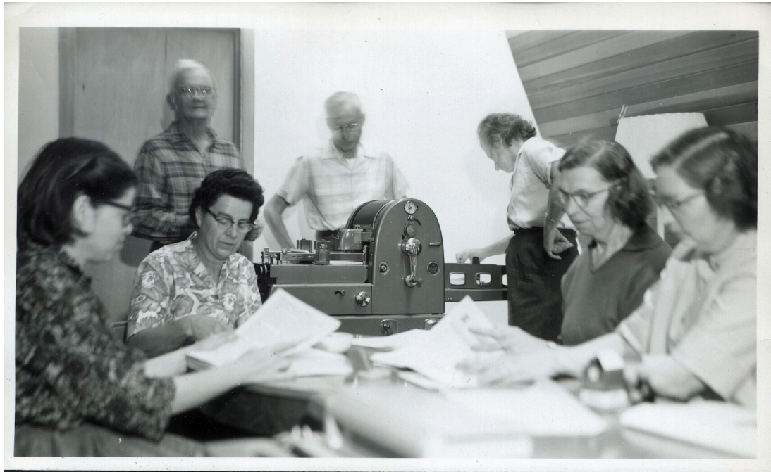
Photo of Obsidian Publications Committee with mimeograph taken May 9, 1964

September 1991: In very small vertical letters, Bulletin was added to the masthead.