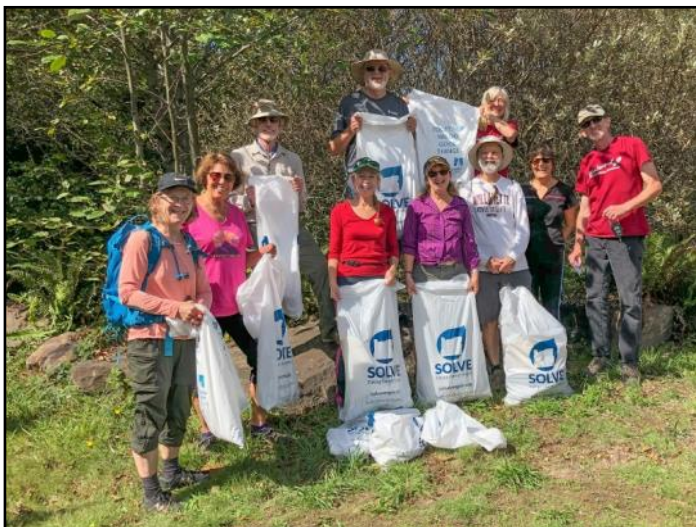
Beach Clean Up Crew.