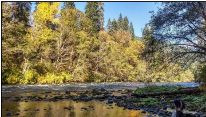
Fall colors on the McKenzie.