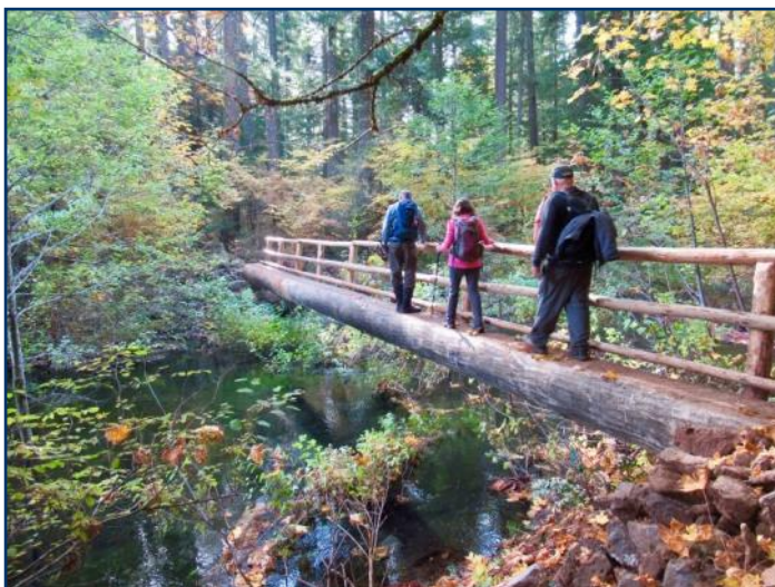
Vern Marsonette, Lynn Meacham, and Brad Bennet on the foot bridge.

on the trail was ours. We traded off the lead position among ourselves but continued at a brisk pace since daylight is in short supply this time of year. We hiked in awe through bright fluorescent-lit tunnels of golden-yellow magnified brilliance as the sunlight filtered down through the upper canopy of the conifers onto the vine maples and big leaf maples below. You probably can experience this for only a week or two every fall season. Simply magnificent! Well, after stopping for lunch and several rest-nature-water breaks, we arrived back at Belknap Hot Springs at 4:30. After nearly 22 miles of brisk hiking, we were more than happy to see the end. Everyone made it without injury other than feeling completely exhausted. After retrieving the cars at the upper trailhead, we headed down to Rainbow and enjoyed a well deserved dinner at Takotas. Most of us were staying the night at Belknap, so after dinner we headed back for some soaking time in the hot springs pool. Then it was another campfire evening at Vern's RV site. The McKenzie River Trail this time of year is a real gem. Crowds are light and really only in the area of the falls and pool. With this being a very popular mountain biking trail, we only encountered six bikers all day. Members: Brad Bennett, Marguerite Cooney, Whitney Gould, David Lodeesen, Vern Marsonette, Lynn Meacham. Nonmembers: Kiley Marsonette, Daniel Fries.