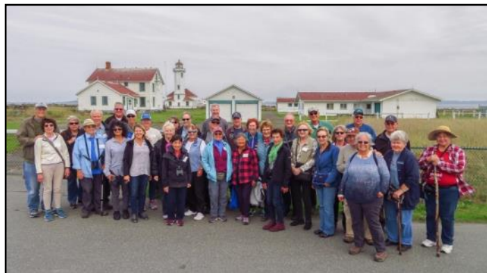
At Point Wilson Lighthouse near Port Townsend.

An excellent guided tour of Port Townsend took us through downtown, uptown and historic Fort Worden. Our days in Port Townsend and Port Angeles allowed free time for walking, dining, shopping, and bicycle riding. Some folks took the ferry ride over to Whidbey Island. Points of interest in Forks