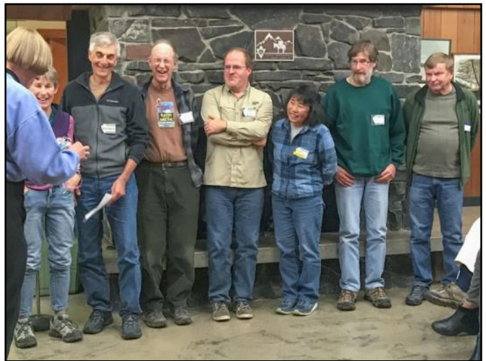
Recipients of the Winter Trails Maintenance Snowflake award.