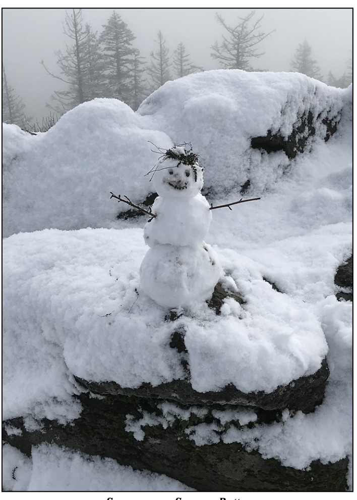
Snowman on Spencer Butte.

[ February 27 : Cancelled due to snowstorm.]