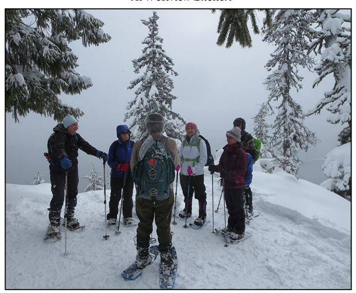
Planning rest of the day at Odell Lake overlook.

(unusual because Oregon's snow is often 'wet and heavy'). We used our tire chains to maneuver the parking lot. I'm glad we had a couple of small snow shovels along. The state police were issuing $110 tickets to cars parking on the state highway, not on the snowpack. A pine marten was seen crossing our