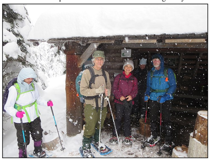
At Westview Shelter.

THE WINTER STORM CHANGED OUR SALT CREEK FALLS HIKE PLANS to a Gold Lake Sno-Park outing. Our snowshoe hike led us past the Mountain View Shelter and on to the Odell Lake Viewpoint. There was 18" of new 'light/dry' snow