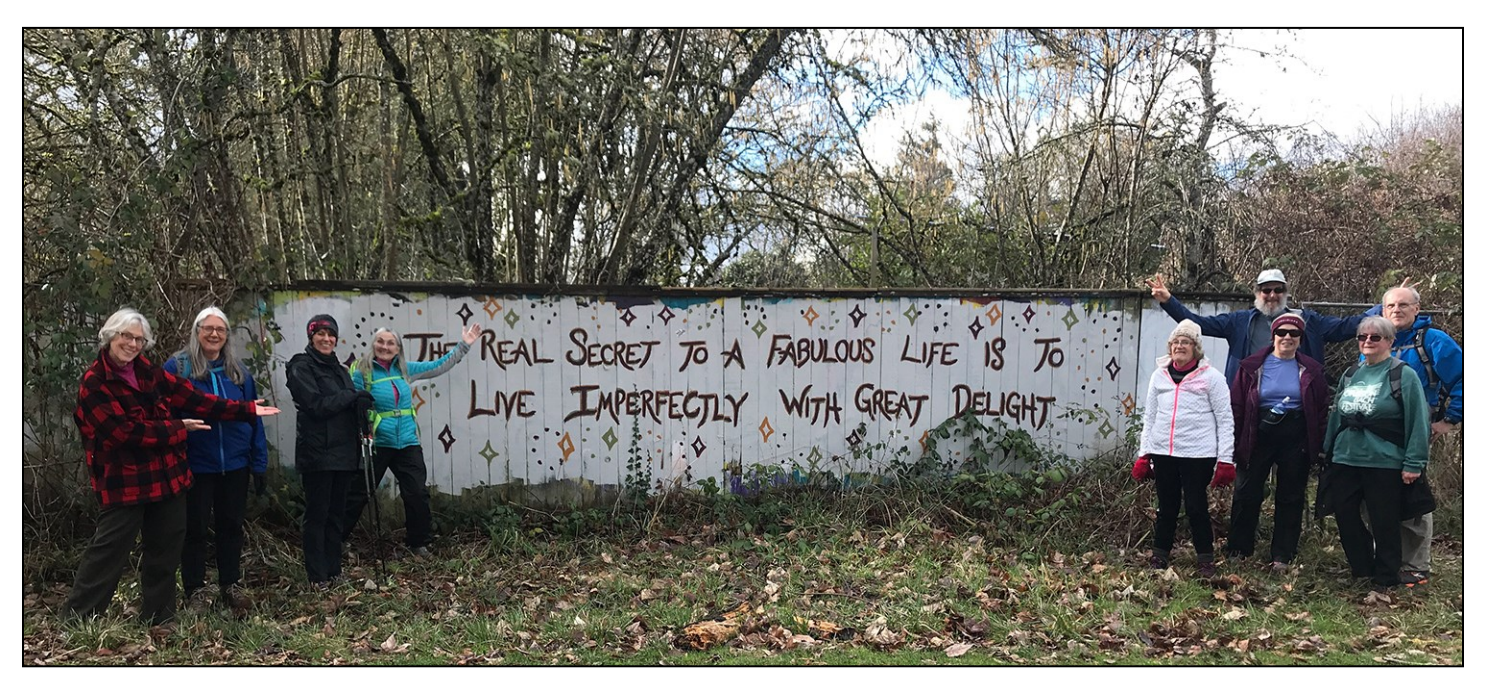
The group by the "words to live by" fence. River Path North hike. See trip report on page 6.