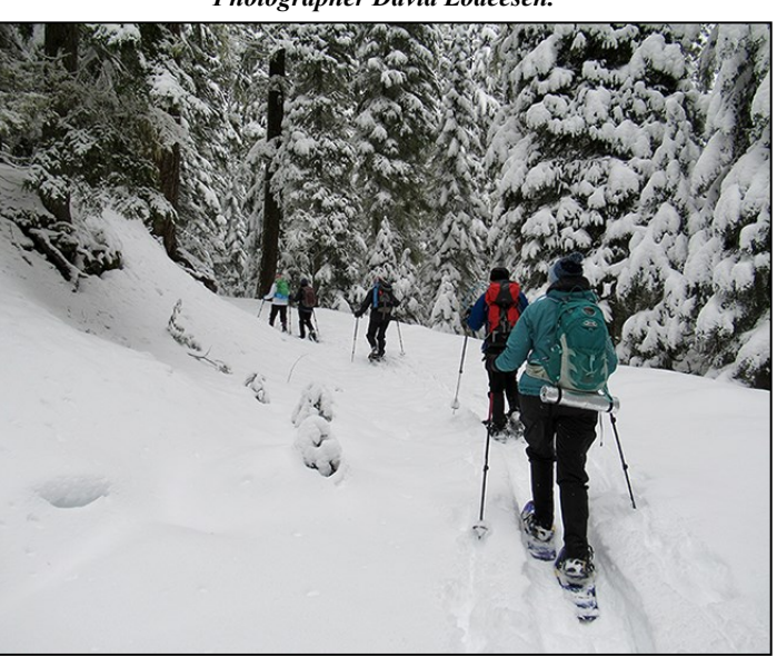
The group of 7 Obsidian snowshoers eventually finds the Pengra Pass trail but ends up breaking fresh trail the whole way.