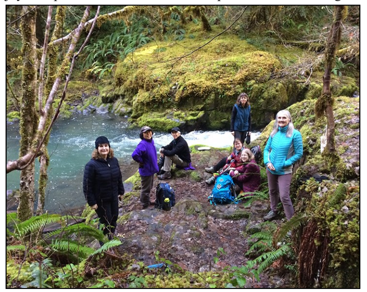
Snack / lunch break at the pool where we turned around.

E HAD A LOVELY, RELATIVELY WARM, SUNNY SPRING-LIKE DAY for our hike along Larison Creek to the pool three miles up the trail. We had the trail to ourselves and enjoyed a pleasant lunch break at the pool before returning as