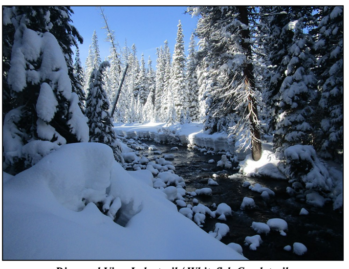
Diamond View Lake trail / Whitefish Creek trail.