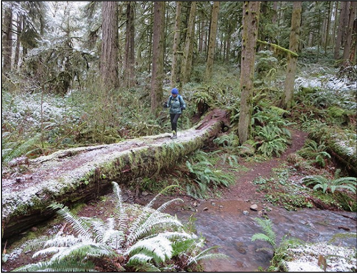
Dorene Staggell crossing the creek.

CHANGING WEATHER FORECASTS DIDN'T DETER US. It turned out not to be as cold as some predictions and no snow fell on us. It was nice to see the snow on the ground but with a