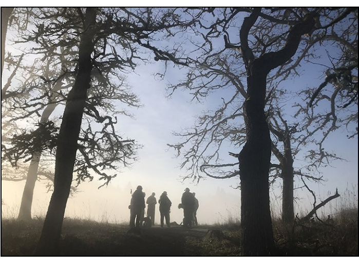
Waiting at a foggy junction.

Janet Jacobsen (1/19 and 1/27) Hike: 6 miles, 1,100 ft. (Moderate)