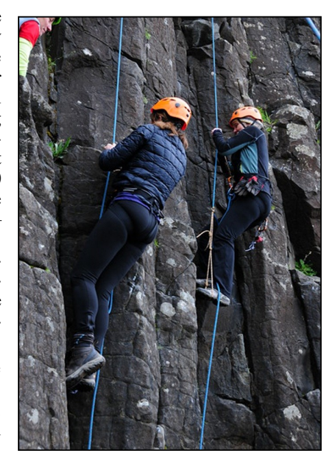
Ascending fixed line.

More information on the class is on the Climbs page of the Obsidians webpage. Registration opens at 7:00 AM on Feb. 16, 2019. One of the many benefits of being an Obsidian member is that you can preregister for the class. To learn more contact climbs@obsidians.org .