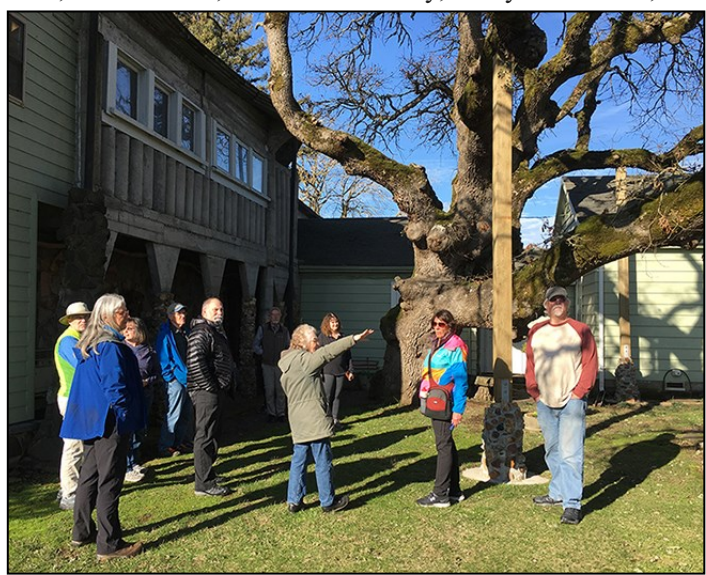
Living Rock Studio with the artist's daughter giving the tour.

GREAT DAY, GREAT GROUP!! WE WALKED ABOUT SIX MILES in Brownsville and visited historical sites, including Pioneer Park, the Millrace, Pioneer Cemetery, many old homes, the