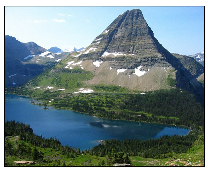
Hidden Lake from Going-to the-Sun Road NPS Photo Gallery

Bring your favorite potluck dish to share ... along with your own plates, utensils and cups ... and $1 to help cover club expenses.