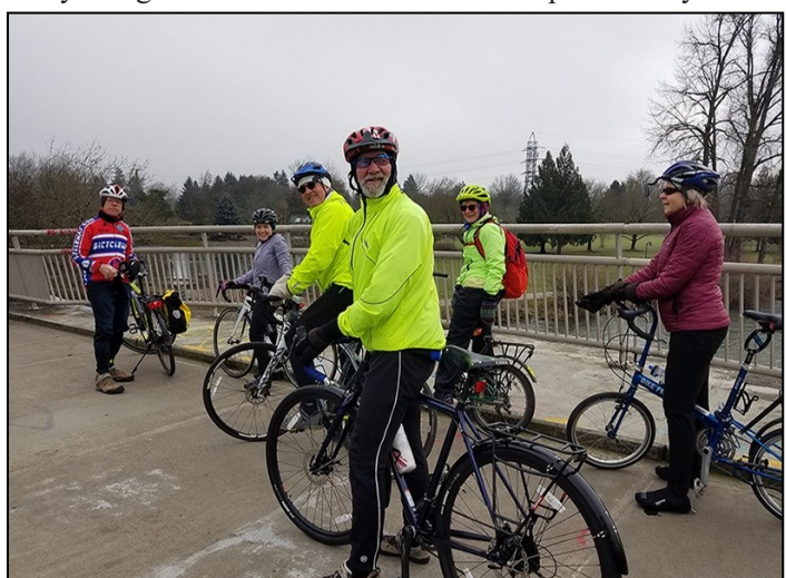
Where's Waldo at the Defazio Bridge

COLD AND FOGGY WAS THE ORDER OF THE DAY as the ten rode into the abyss. We navigated the Willamette River via many bridges as we all told stories of the past. Today was a