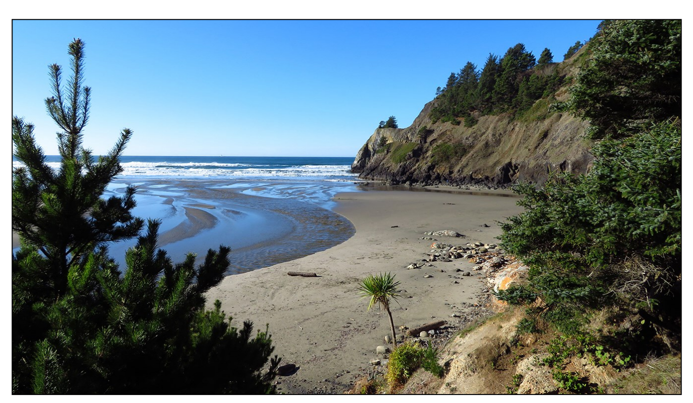
Little Creek turns the bend and enters the Pacific. See Yaquina Bay to Yaquina Head trip report on page 6.