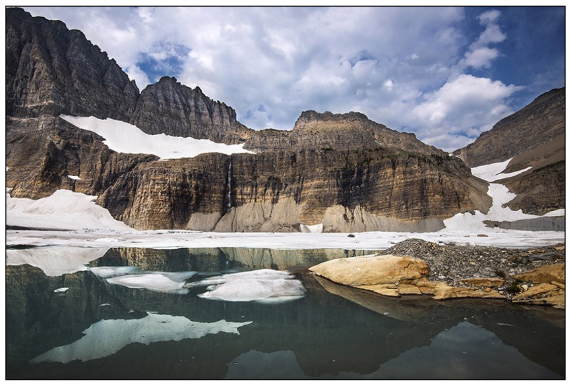
Grinnell Glacier Basin NPS Photo Gallery