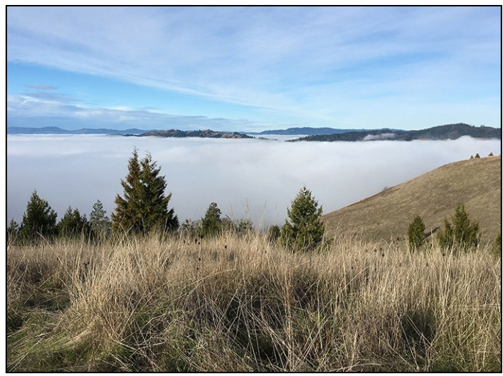
At last above the fog.

WHAT A SURPRISE TO HIKE ABOVE THE FOG TO ENJOY a sunny hike on the boundary ridge with its dramatic views. The trail was in good shape except for a few muddy spots at