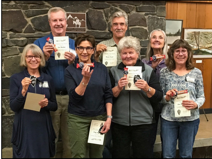
100 Trips Award Recipients