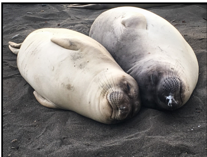
Harbor seals at Punta Gorda Lighthouse

WE SAW MANY TRACKS IN THE SAND , including bear and cougar. Next to the abandoned light house was difficult. Our tides were not very high or low which meant the window to get through areas passible only at low tide was short—sometimes we had to rush. There was plenty of rain—mostly at night but some heavy fog and short periods of sprinkles during the day. Conditions were warm. Little wind and temps in the high 60s. We saw three sunsets. One day we hiked up Saddle Mountain. The 3,000' elevation had no pay off. All the