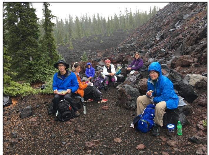
Lunch spot out of the clouds