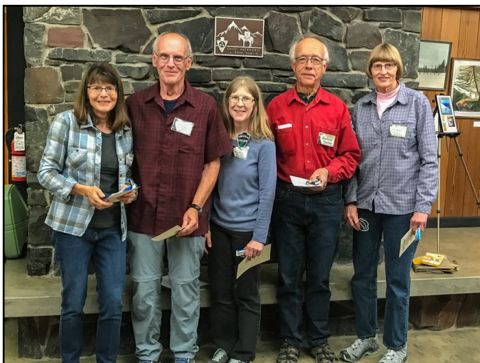
25 Leader Award Recipients