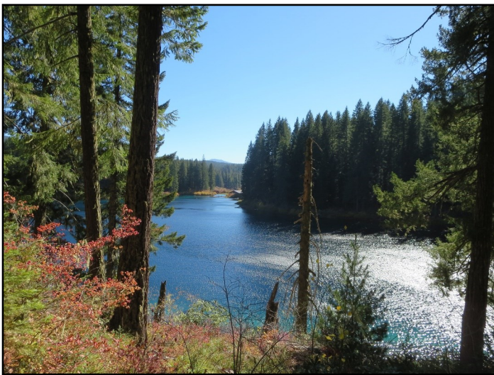
The view of Clear Lake instead of Patjens Lake

WE WERE GREETED AT THE PATJENS LAKE TRAILHEAD by temperatures in the low 30s and high winds 20–40 mph! At first I was concerned we would be able to stay warm in these conditions. Just as we tentatively started on the trail, the wind began to topple multiple dead snags—right from their bases! Five fell within 30 seconds (almost hitting some hikers in front of us). We retreated to our vehicles and made the quick decision to hike at Clear Lake instead. We had a beautiful, uneventful hike around Clear Lake. The fall colors were not quite at their peak, but provided plenty of color to contrast with the beautiful green waters of the lake. Members: Keiko Bryan, Kathie Carpenter, Marguerite Cooney, Julia Harvey, Holger Krentz, David Lodeesen, Lynn Meacham, Kathy Randall, Darko Sojak, Charlie Van Deusen. Nonmembers: Angie Ruzicka.