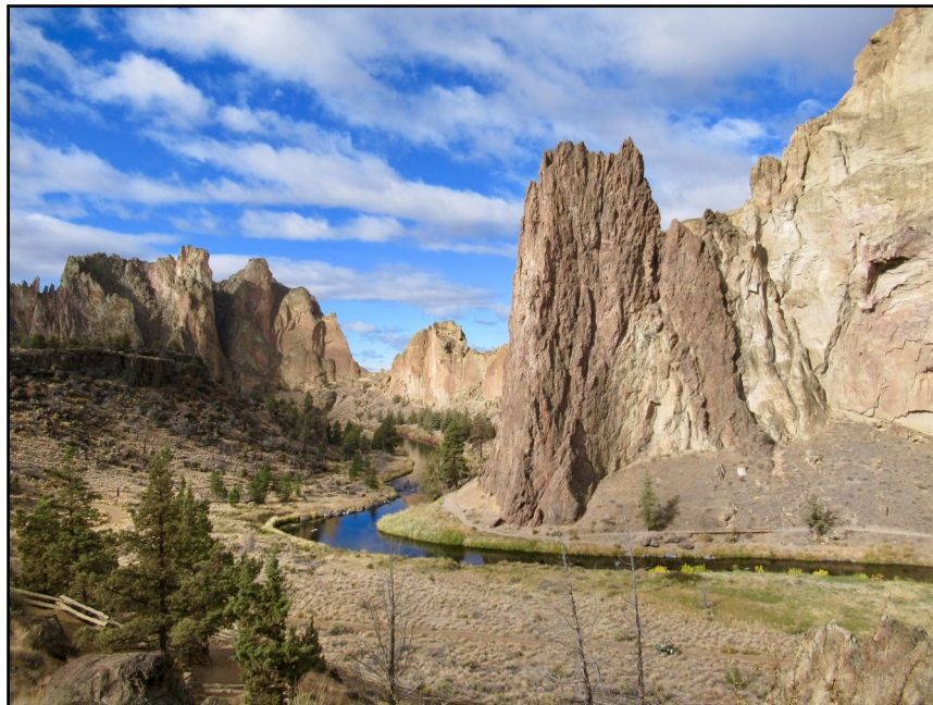
Entering the Smith Rock Trail. See trip report on page 10.

ENJOY the photos in color! ONLINE Bulletin at www.obsidians.org