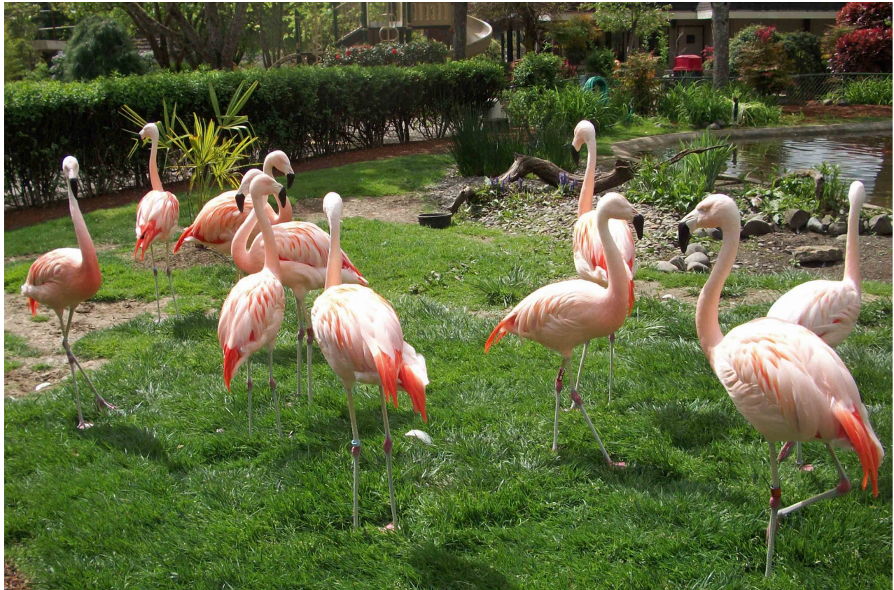
Welcoming committee at Wildlife Safari. (See trip report on page 5)