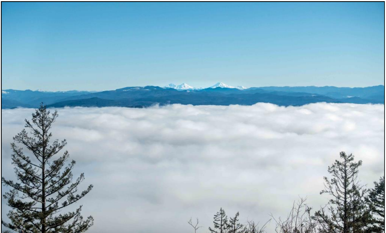
Cascades from Spencer Butte