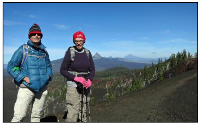
We had shelter for most of the way to Four-In-One Cone,

AUTUMN HAS COME TO THE HIGH COUNTRY. We were greeted at Scott Trailhead with high winds and cool temperatures.