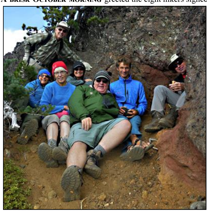
up for a hike up the 7,251 foot Black Crater on McKenzie

A BRISK OCTOBER MORNING greeted the eight hikers signed