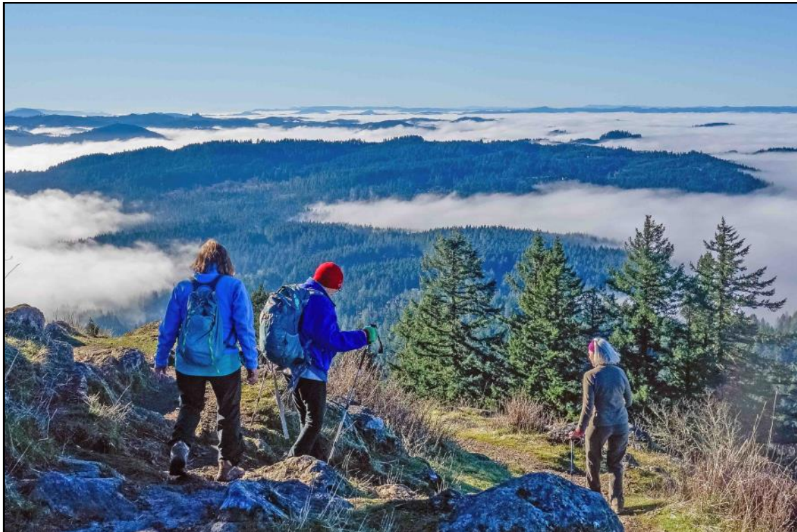
from the top of Spencer Butte on 1/7/15