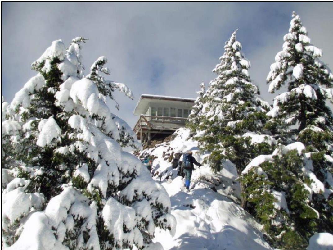
Lookout approach on Cowhorn Mt.