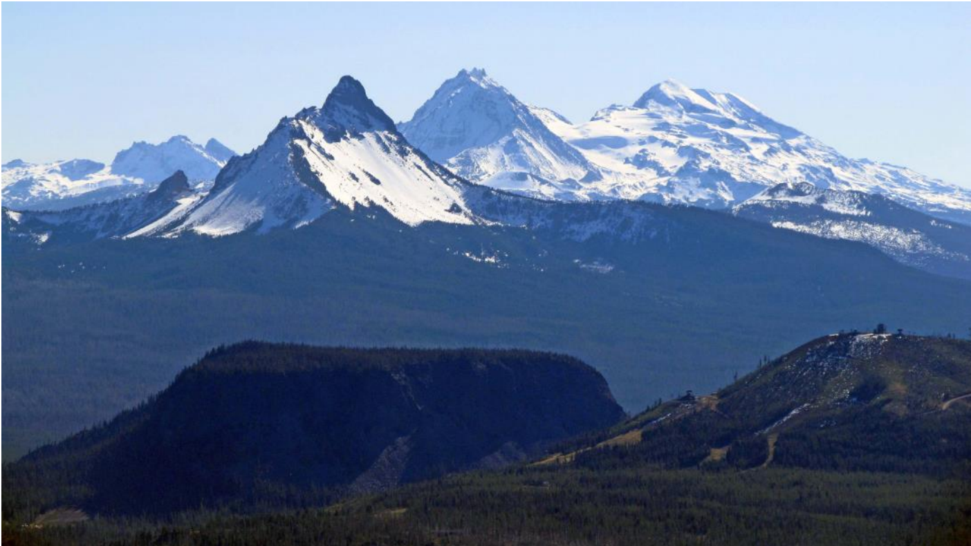
View from Maxwell Butte (See trip report on page 17)