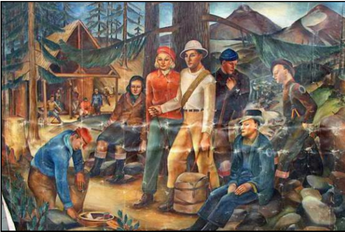
Painting prior to restoration