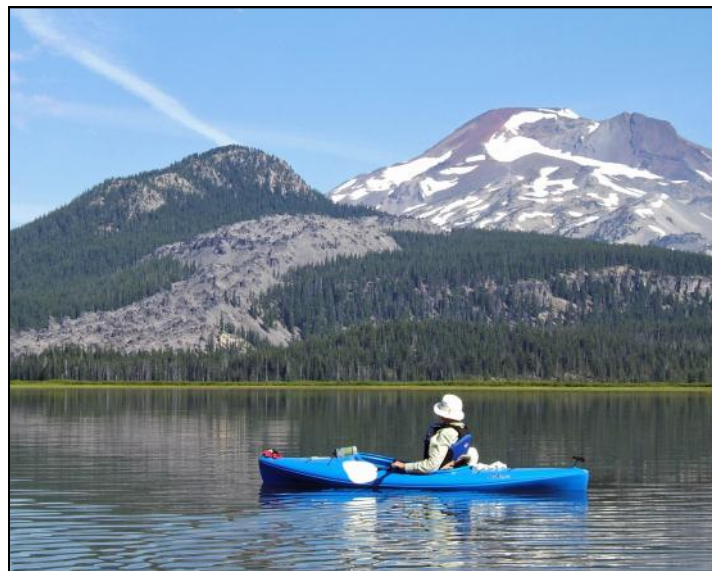
Pat Esch on last year's women's kayak trip.

Pre-trip is Monday, August 5 at 7 PM at the Lodge where we will discuss car pooling, camping, dinner teams, etc.