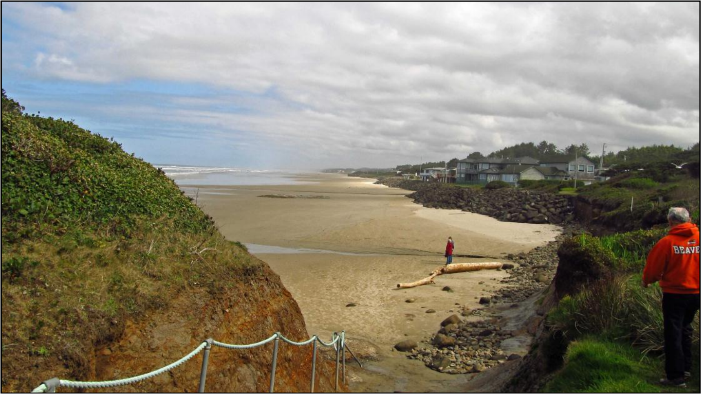
Beach near Yachats (See trip description on page 7)