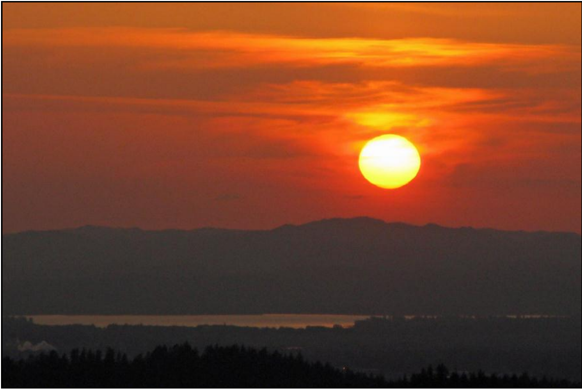
Sunset over Fern Ridge from Pisgah. See May 5 Pisgah trip report on page 9.