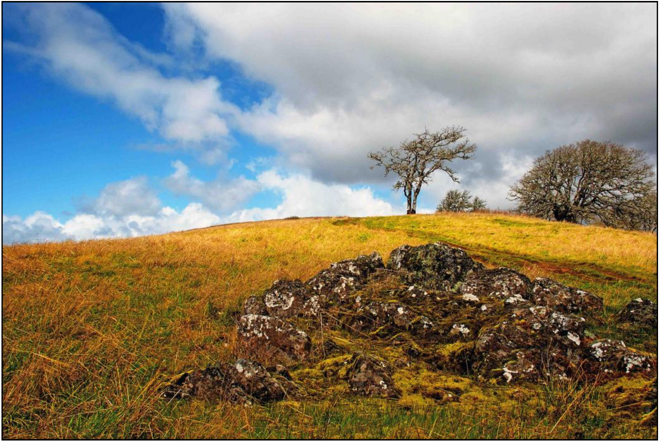
Buford Park after a storm. See articles on Buford Park events on pages 10 and 12.