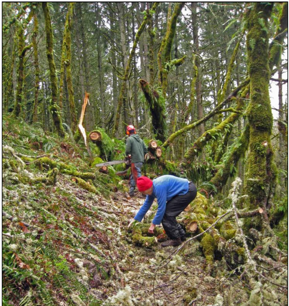
Working on Ridgeline Trail