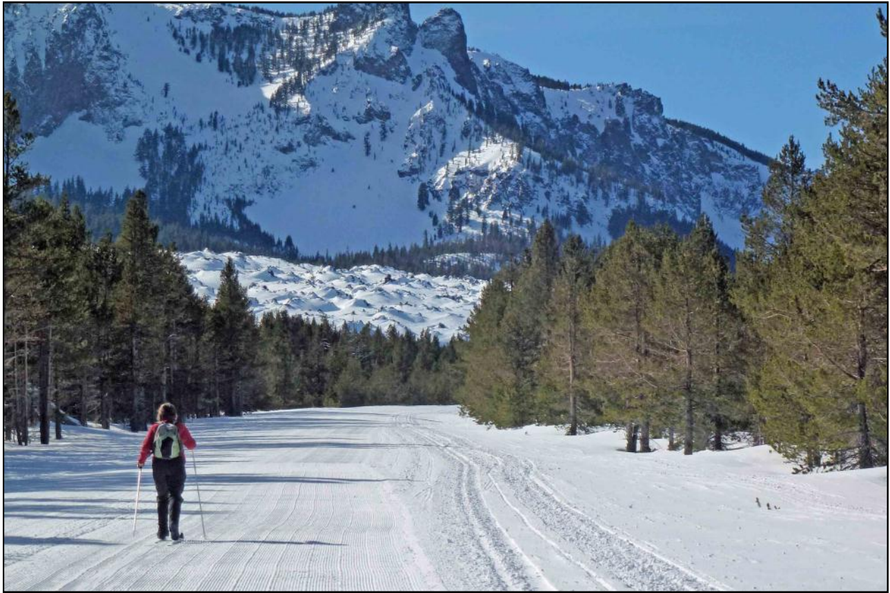
Big Obsidian Flow. See Newberry Crater extended trip report on page 9.