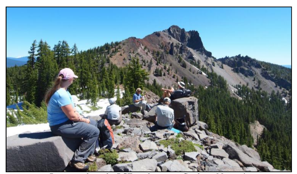
Rest stop along the PCT on the way to Cowhorn Mountain