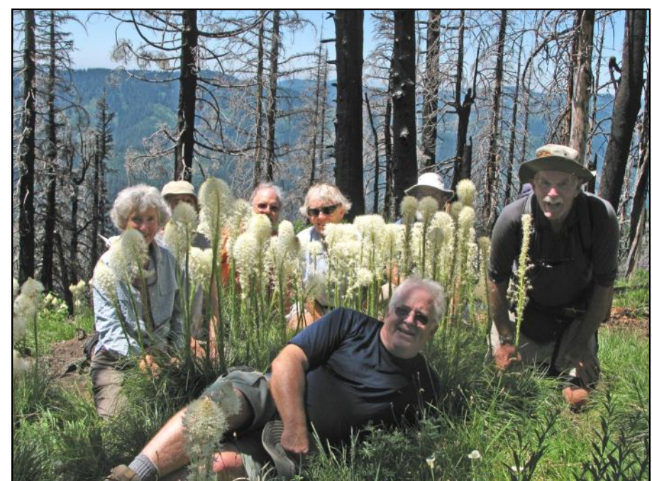
Trolls(?) on Chucksney Mountain

NOT THE BEST BEGINNING: WE HAD WALKED less than ten minutes before losing one of our group members due to mistaken directions from the trip leader. Blowing whistles proved ineffective. Soon we were reunited and in a counterclockwise loop climbed on up the mountain under pleasant conditions. Wildflower blooming seemed delayed in the meadows below the summit. After lunch at the highest knoll with views of many of our favorite peaks, we proceeded along the ridge where we found one patch of bear grass in particularly beautiful full bloom. Under the influence of the trolls we were sure must live there, we lolled, crawled, and played around among the blooms for awhile before continuing around the loop. Descending to the