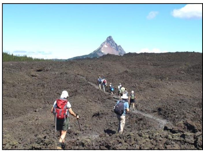
Across the lava beds, Mt. Washington beyond.