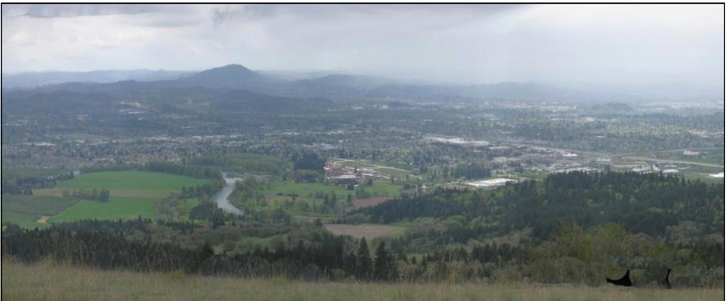
Typical April view of Eugene and Spencer Butte from Old Baldy. April 24th Old Baldy/Coburg Hills hike.