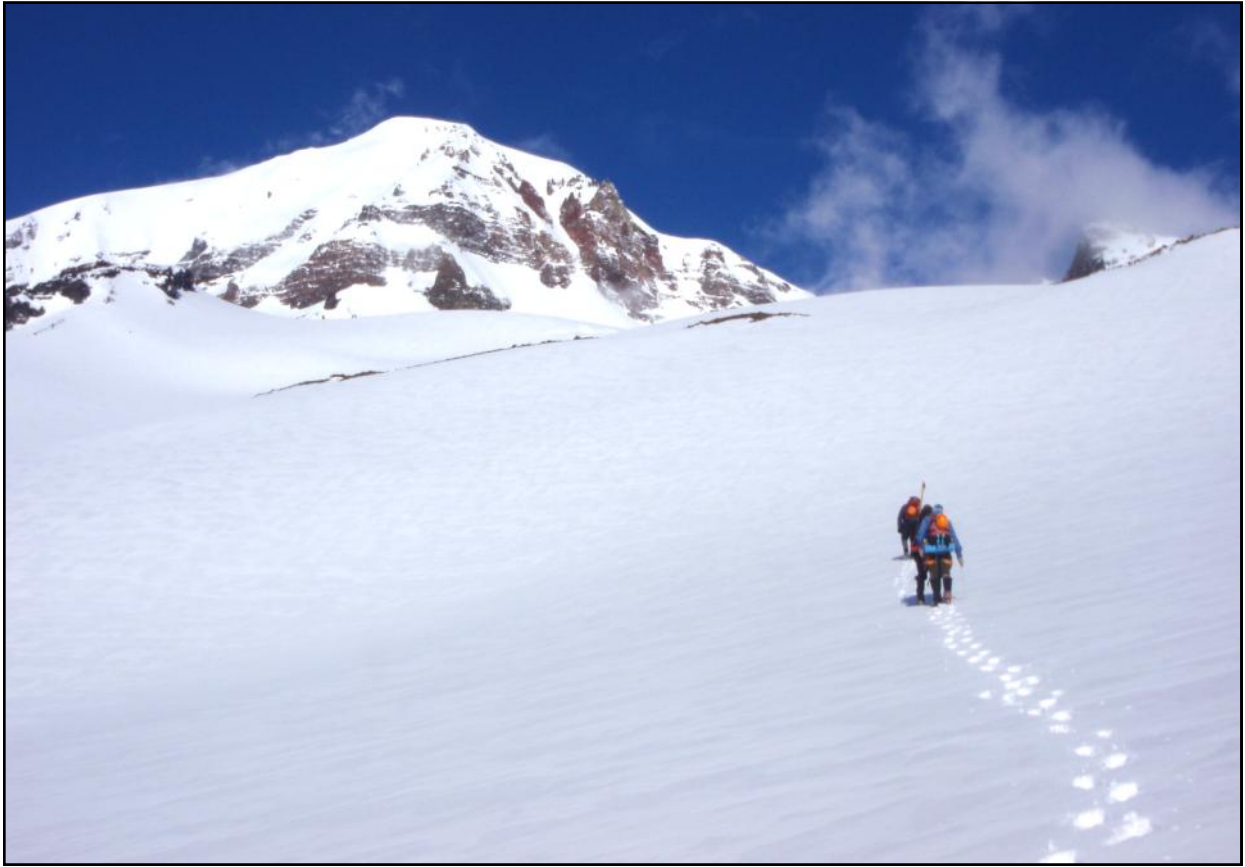
Approaching the Middle Sister. See the climb report Page 9.