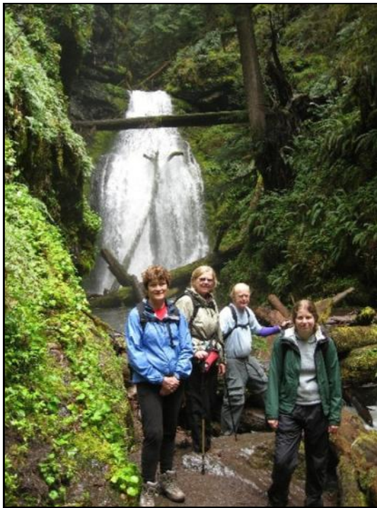
At Trestle Creek Falls

THE ORIGINAL PLAN was to use a car shuttle and walk downstream from the upper trailhead for a hiking distance of 8.5 miles, but with just seven hikers, a car shuttle was not practical. So we chose Plan B which was to still start at the upper trailhead, take the loop route to Upper Falls, walk downstream for a distance and then come back to the upper trailhead using the lower trail. Since there had been some heavy rain the previous five days, we were rewarded for the efforts of a steep climb to Upper Falls with a thunderous waterfall, one of the heaviest flows I have seen. We paused to enjoy the sight, then walked behind the falls and continued on down the hill. We walked