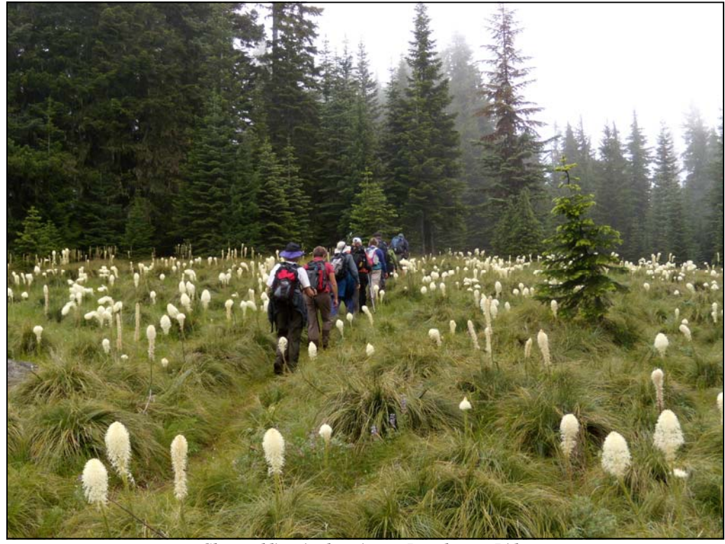
Ghost soldiers in the mist on Bunchgrass Ridge

THE FORECASTED THREAT OF THUNDERSTORMS didn't deter the group of hikers that ventured to explore the Bunchgrass Ridge section of the Eugene to Pacific Crest Trail. Although the weather up there remained misty, cool and damp, neither a rumble of thunder nor a flash of lightning was witnessed to prevent completion of this mission. Instead, the nine of us encountered a profusion of bear grass in full bloom, with several meadows carpeted with these tall spikes that have white topknots of minute flowers. In fact, appearing as they did in the mist, the flowers took on a rather surreal look of legions of ghost soldiers. The bear grass bloomed throughout the woods and in the old Warner Creek burn area, where they were mixed with pink rhododendrons. Although the mist prevented us from enjoying the usual views from this ridge that runs parallel to Highway 58 above Oakridge, everybody agreed that the bear grass made the trip worthwhile. We cut the hike short since we were getting very damp and chilly from forging through the wet overgrown under-