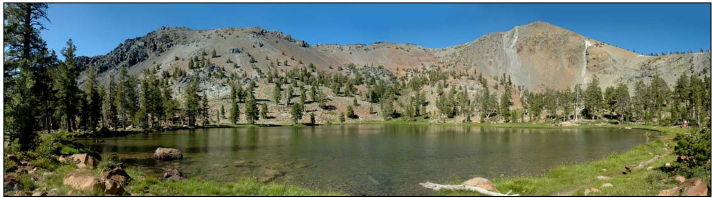
Deadfall Lakes in Northern California - July 24-26 backpack