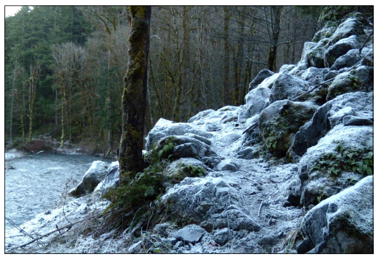
A frosty Salmon Creek Trail. See trip report Page 7.