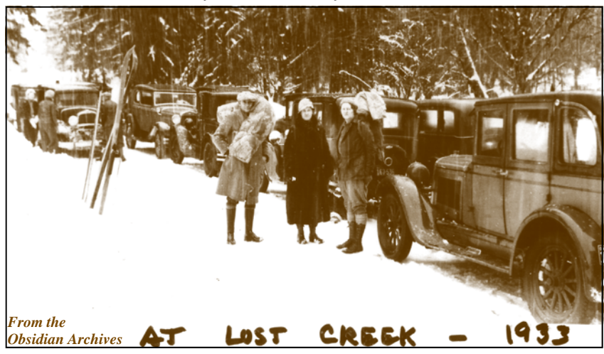
We have <u>always</u> relied on willing drivers, with riders sharing the costs.

HEN GAS PRICES SOARED, we raised our recommended car pool cost sharing rate to nine cents per mile. So, now that gas prices are down, we'll reduce our rate...right? Uh, well, no.