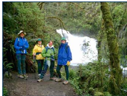
Along Sweet Creek

WE SHIFTED INTO REVERSE and began exploring Plan B after encountering snow-covered roads only a couple of miles after leaving Hwy. 126 on our way to Kentucky Falls. The decision was made quickly to try the low elevation trails of Sweet Creek. The torrents of water and continuous cascades and falls in the Sweet Creek area delighted those exploring it for the first time. The weather was a mix of misting rain, bright overcast and plain old Oregon spring sunshine. Trillium, lily, orchid, spring beauty, wood sorrel, wood violets, bleeding heart, red current, salmon berry and fairy bells broke up the continuous carpet of spring green along our trail. The alder trees were just pushing out the first bit of leaf, which allowed us to walk in sunshine for the last mile of the day. Salamanders, slugs and a couple of water