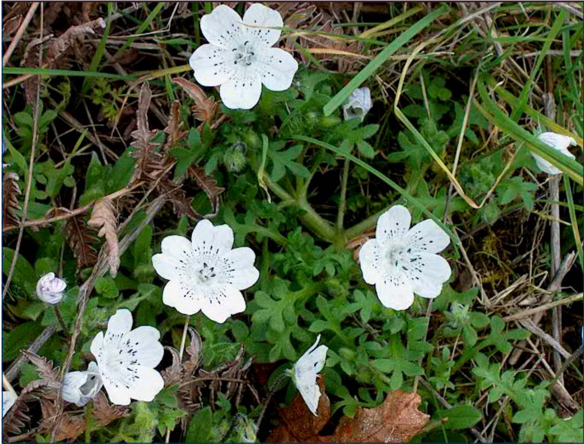
Baby blue eyes along the trail, North Bank Deer Preserve. See trip report Page 10.