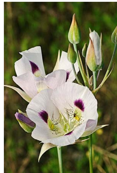
Big-pod Mariposa Lily Calochortus eurycarpus