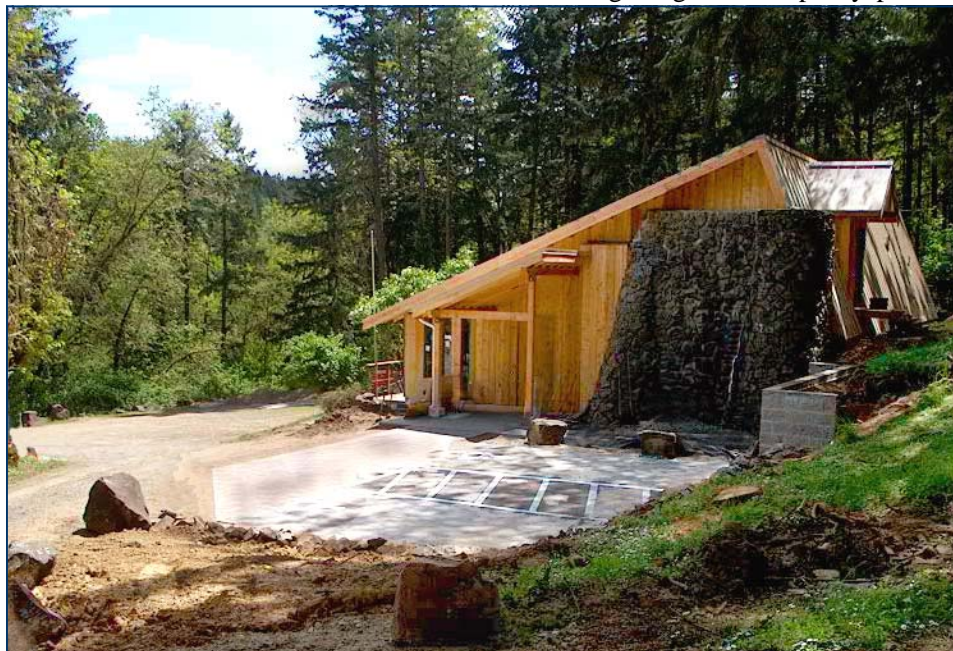
Handicap parking complete.

• Contractor 2G has completed the major work, with only odds and ends remaining; such as putting in the doors, which for some reason were repeatedly delayed in shipment (arrival is expected as we go to press).