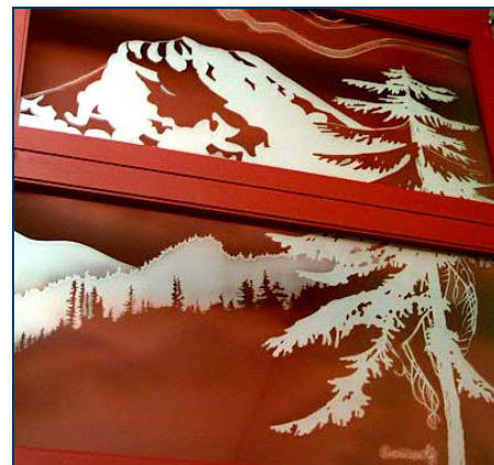
Preview of new etched artwork at lodge.

The following is an update on construction progress, along with some personal impressions and expressions of appreciation on behalf of the Construction Committee and the club in general to those who have made significant contributions to this ambitious project.