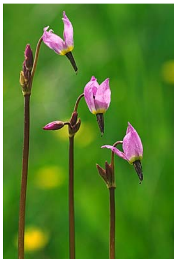
Alpine Shooting Star Dodecatheon alpinum