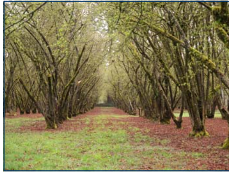
A filbert grove at Dorris Ranch.