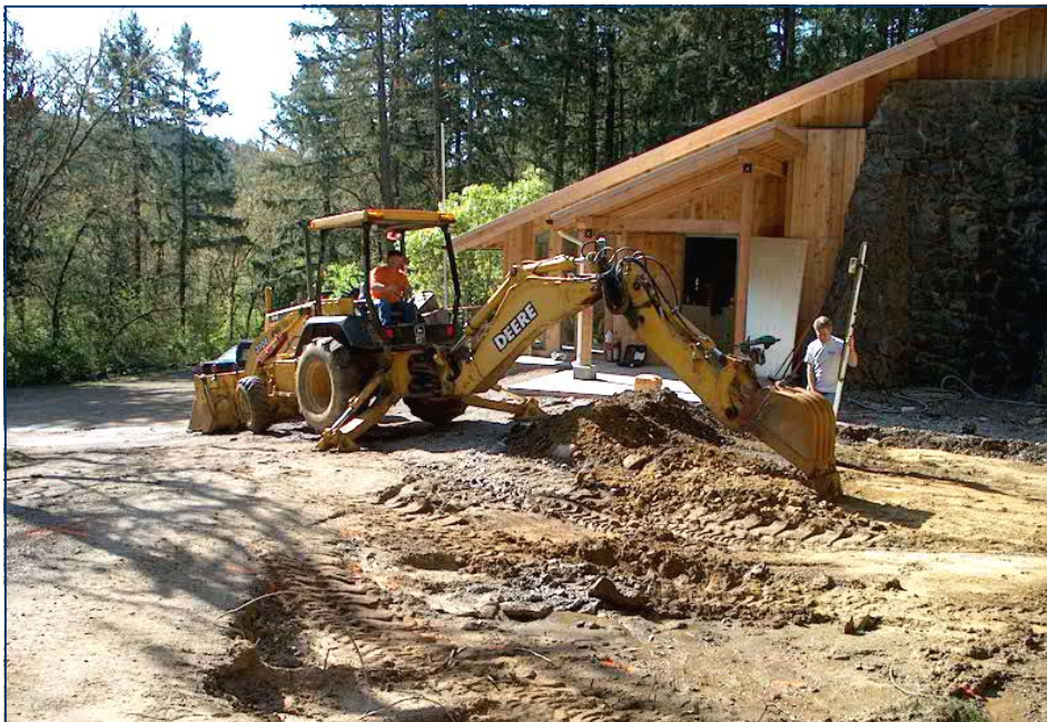
Handicap parking excavation begins.

Of course, the major hurdle still remaining is passing the final inspection and getting our occupancy permit