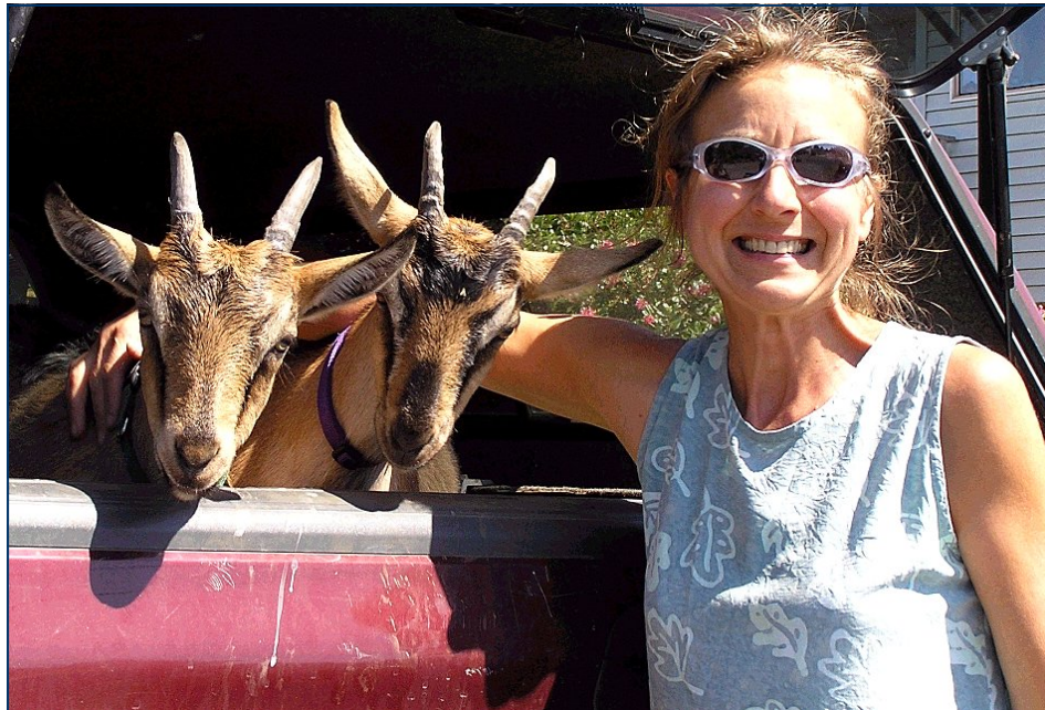
From left: Legs, Plum and Mary

I still have a lot to learn about goat packing. Here's the heads up, though. I'll write some more after the first trip with packs.