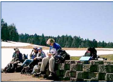
Sun and snow on Mary's Peak

more important, the status of the heavy snowpack which had prevented reaching the peak two weeks earlier. Seemingly miraculous, the clouds gave way to blue sky enroute and the snowpack had melted enough for us to primarily hike off of it. The top of the peak was totally clear of snow. The trail requires a steady, but not steep, ascent over a four-mile distance from about 2,000' to just over 4000'. It is in excellent condition -- very dry for this time of year. The first three and a half miles up the north ridge are through a beautiful hemlock/cedar forest with little undergrowth except in the lower reaches. The flowers we saw -- primarily trillium and yellow violets, but also flowering currant and oxalis -- were present only in the first mile