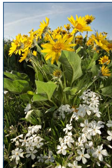
Balsamorhiza sagittata; Phlox speciosa

In my backyard I actively used the guidebook to see how easily I could identify some familiar wildflowers and had little trouble. The only frustration I could see using the guide might come when looking for a plant's common name in the index. Both the Latin and common names appear together alphabetically; however, the authors had to be selective as to which common names to use. Whether my bluebells are a mertensia or a campanula , I won't find "bluebells" as an entry in the index unless I look for "broadleaf bluebells" or "Scouler's bluebells." The same is true for forget-me-nots. One must know "meadow forget-me-not" or